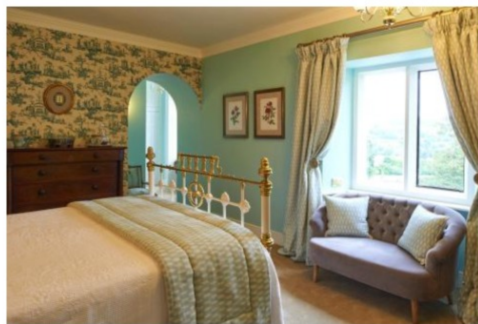
An opulent bedroom at Palé Hall